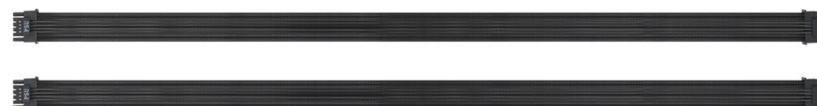
PCI-E Gen 5 (16-pin to 8-pin-8-pin) Cable x 2 (450mm)