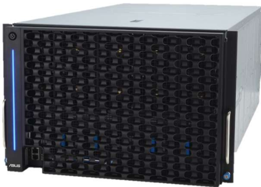
ESC N8-E11 with Front Bezel (Optional)