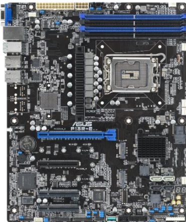
P13R-E 12" x 9.6" ATX