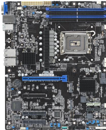
P13R-E/10G-2T 12" x 9.6" ATX